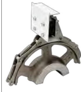
Chain saver mechanism

The SAV type stainless chain is a modified version of the HSS type stainless chain for use on a settlement tank sludge collector. This model uses a chain saver sprocket, which makes it lighter than conventional products with a longer service life that makes it a more economical option. It is also compatible with HSS type stainless chains.