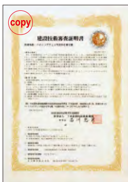
"Construction Technology Review Certificate" Technology: Hinotch Chain Sludge Collector

(Public Interest Incorporated Foundation) Japan Institute of Wastewater Engineering and Technology Construction Technology Review Certificate No. 2110